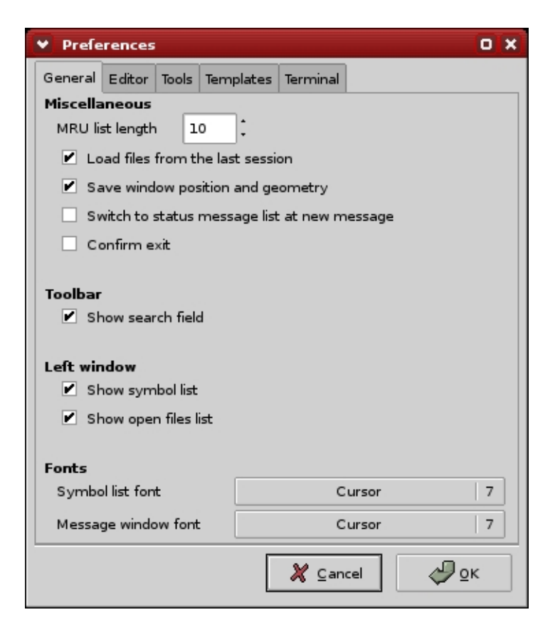
Figure 3-2. General tab in preferences dialog